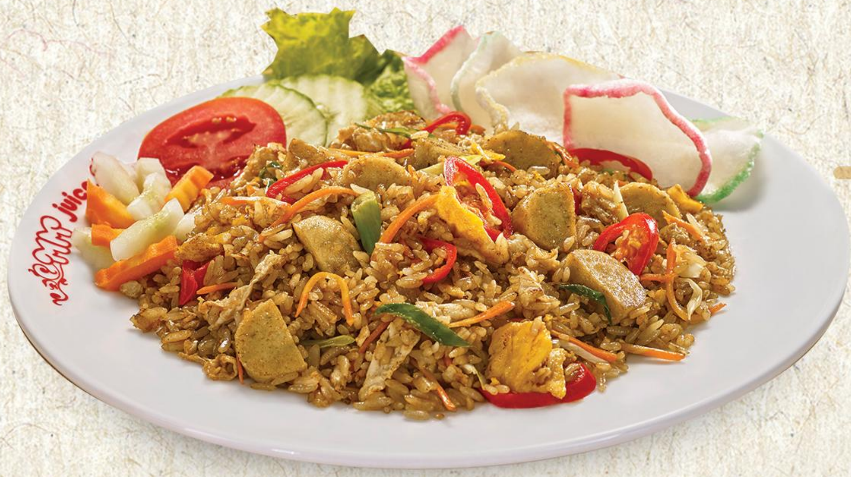
Nasi Goreng Otak otak