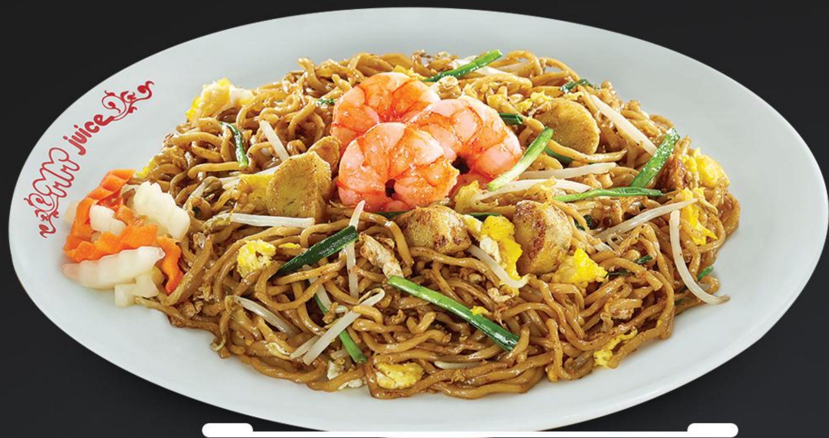
Mie Goreng Seafood