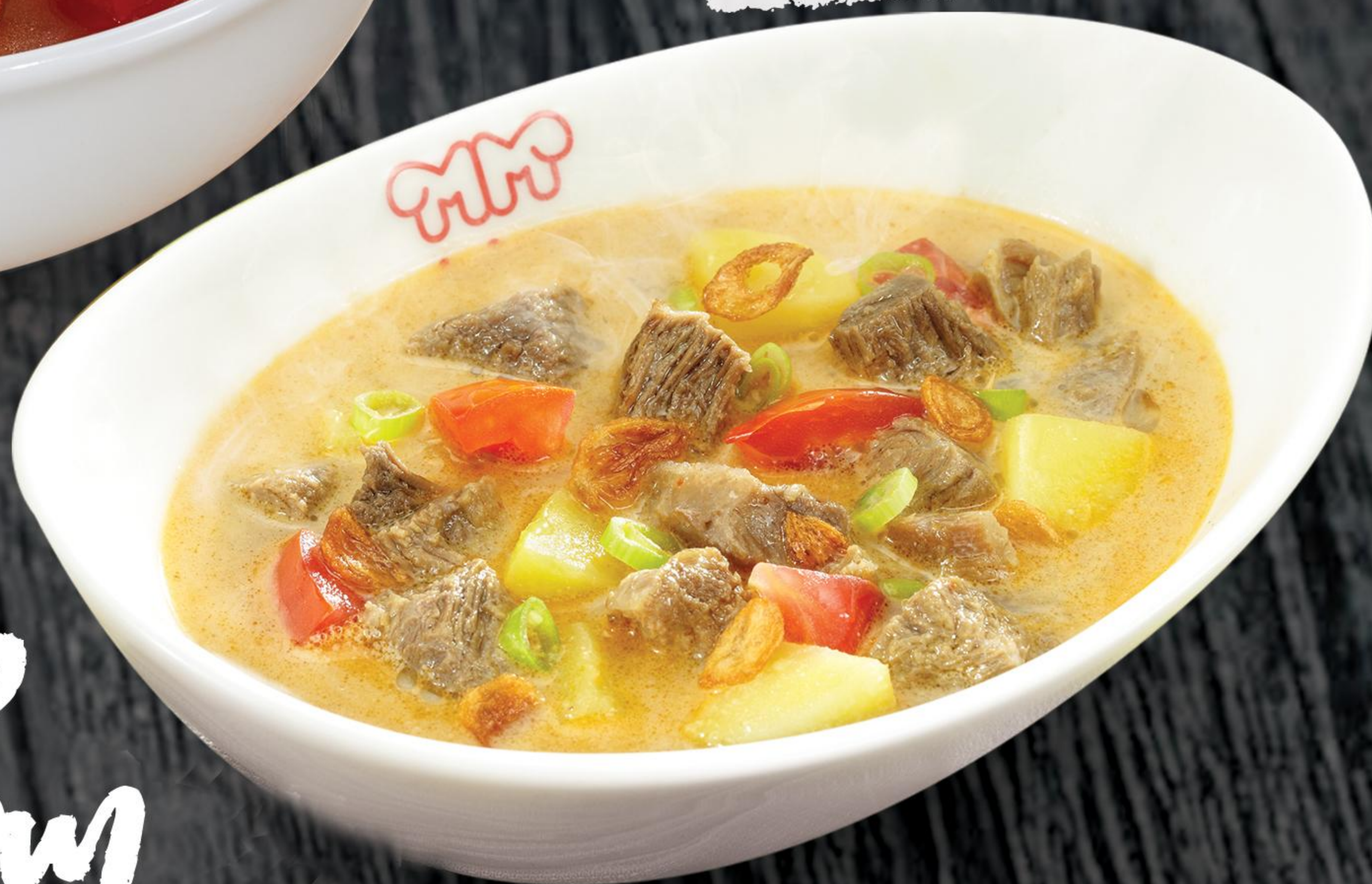
Sop Buntut Kuah