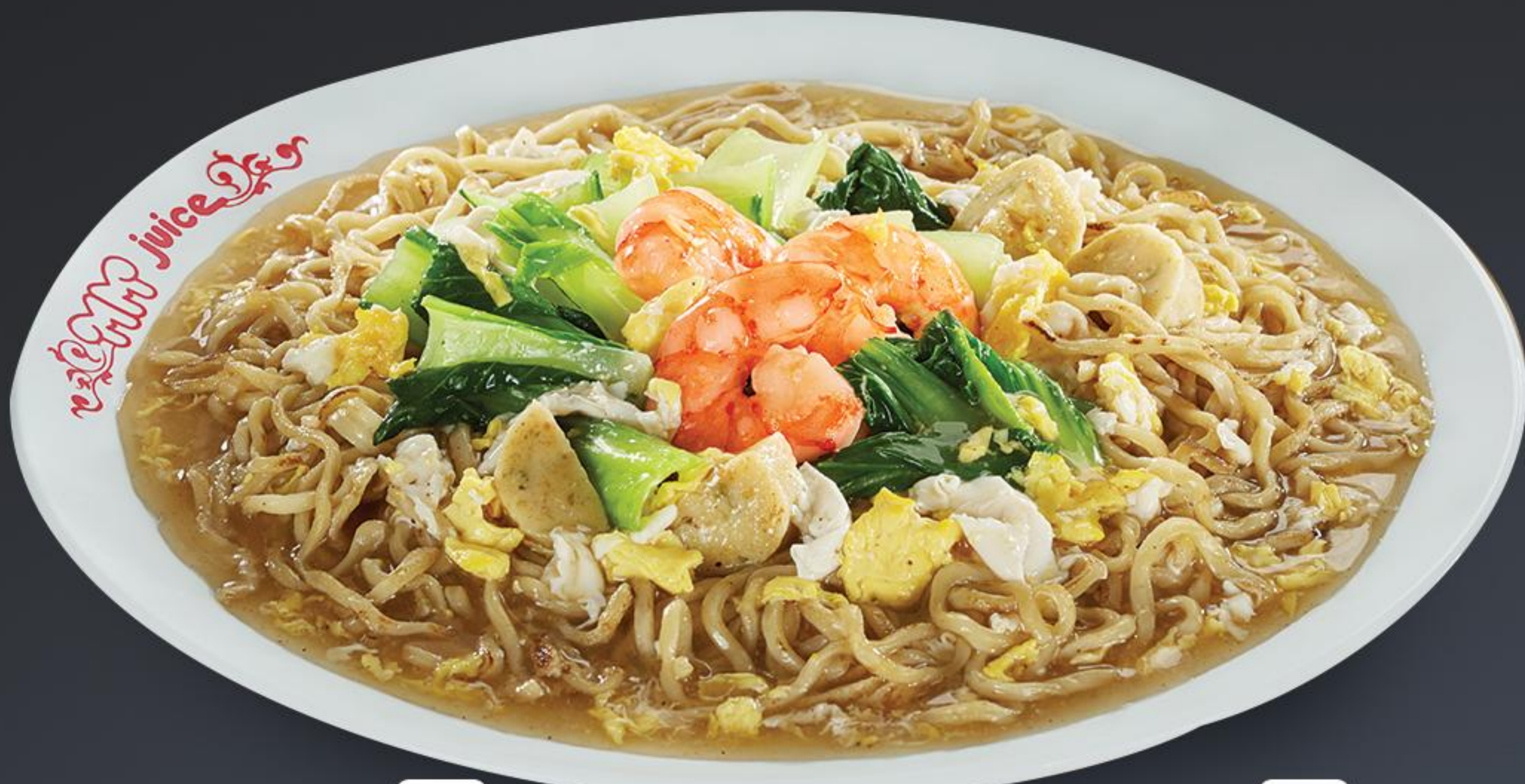
Mie Siram Seafood