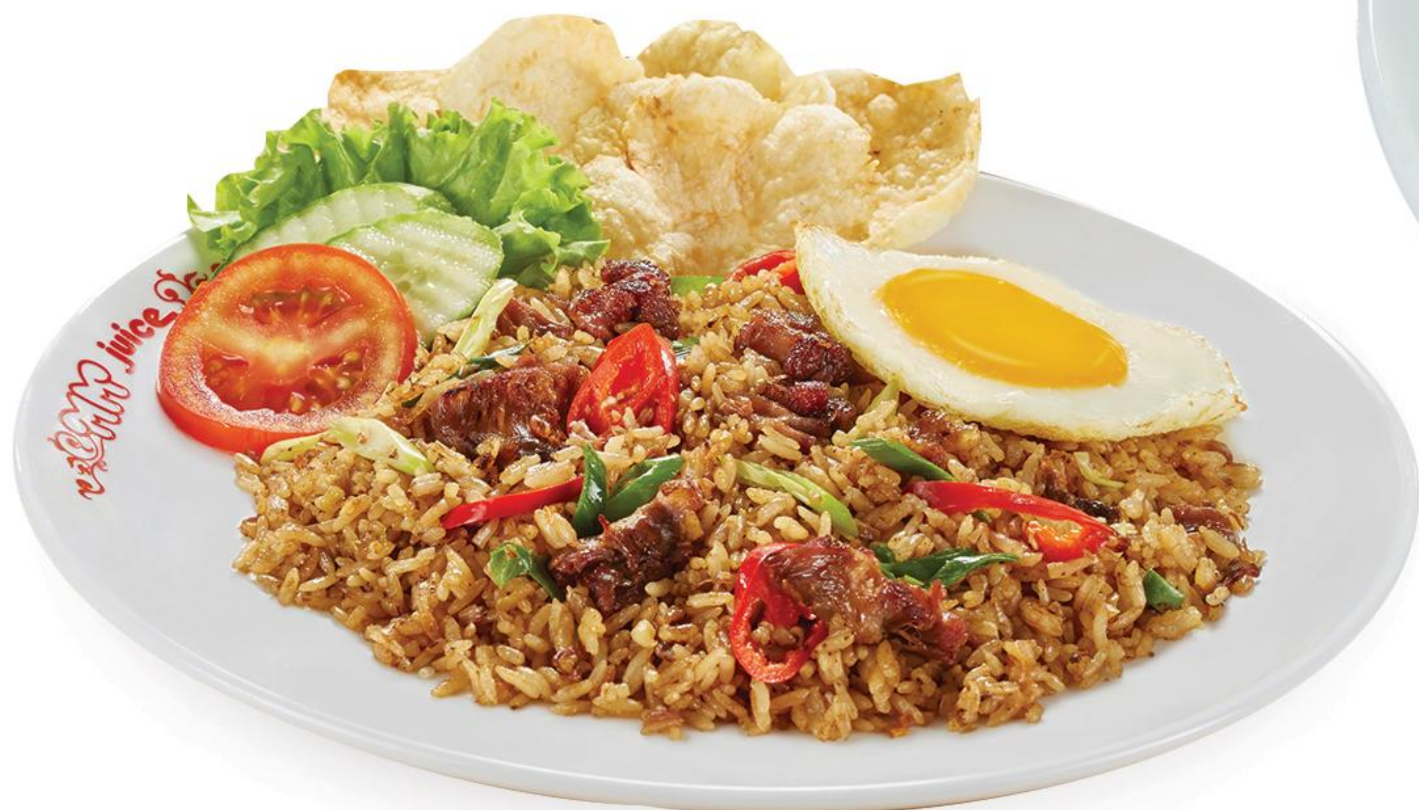
Nasi Goreng Buntut