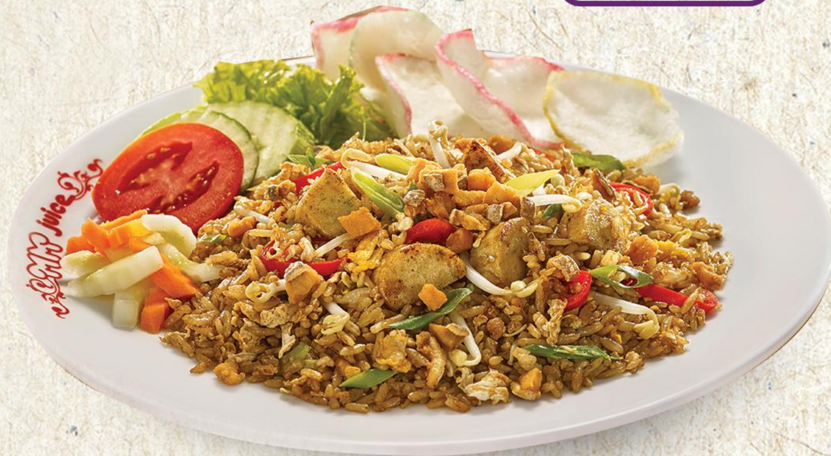
Nasi Goreng Ikan Asin