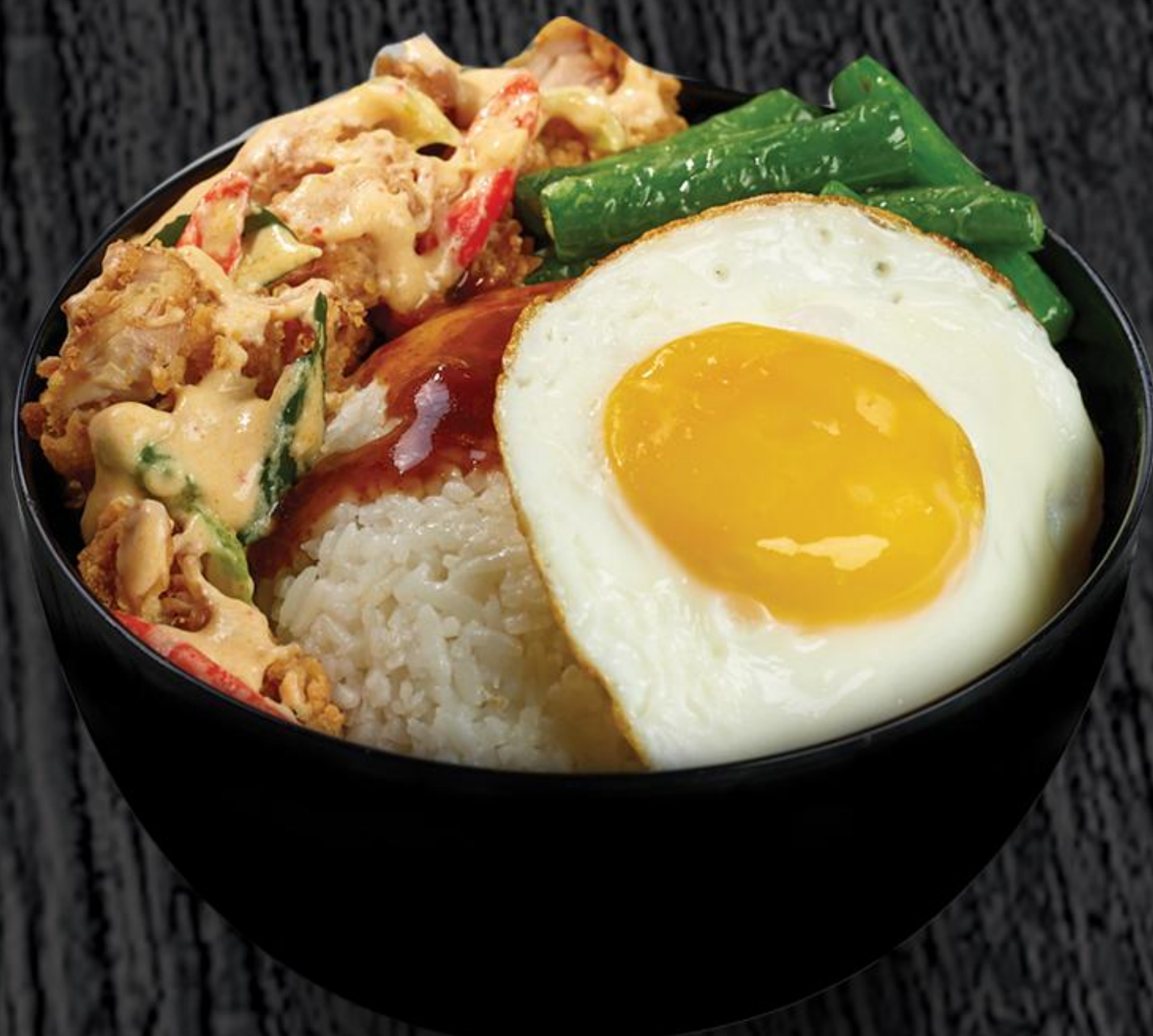
Nasi Ayam Saos Telur Asin