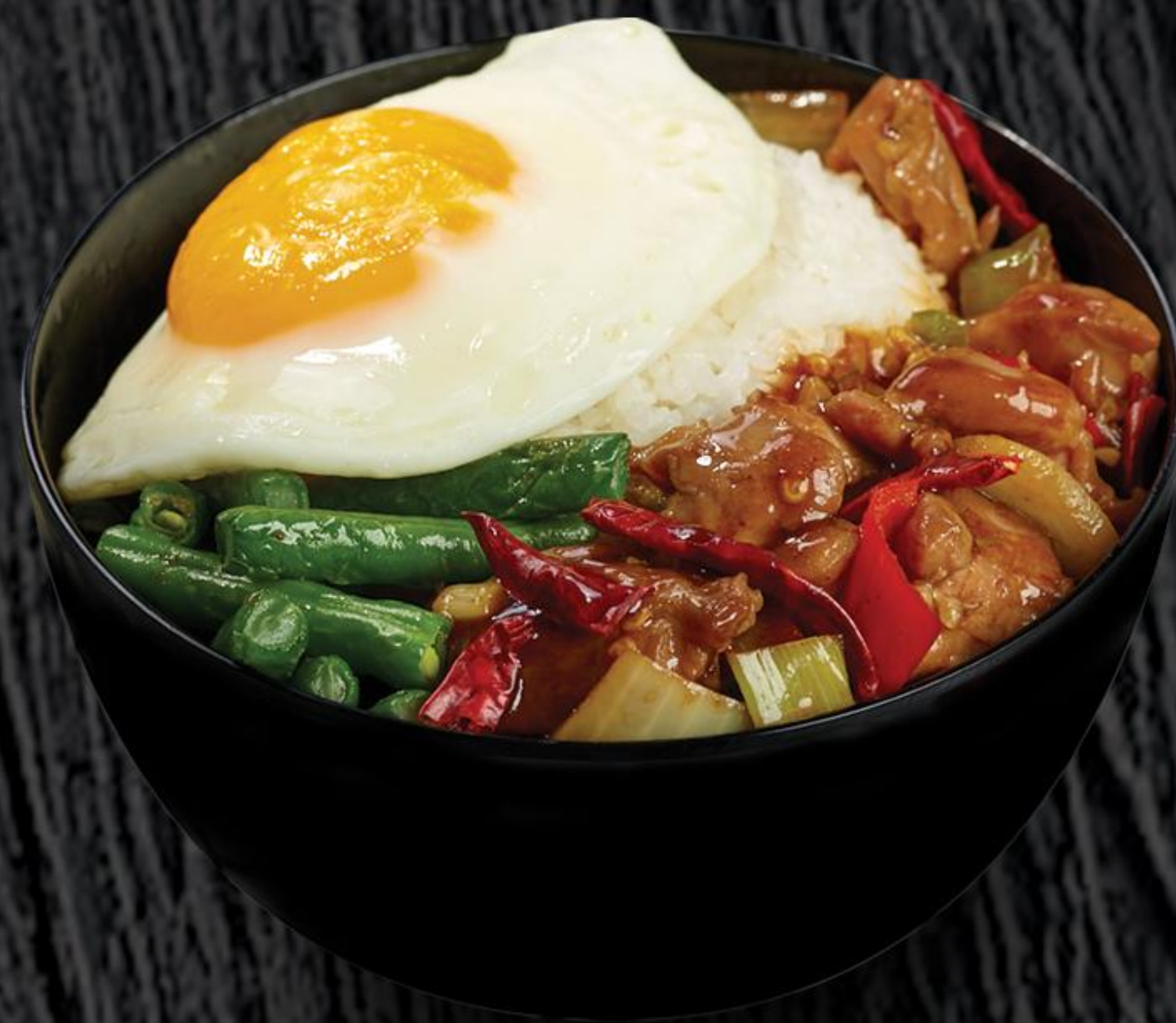
Nasi Ayam Kungpao