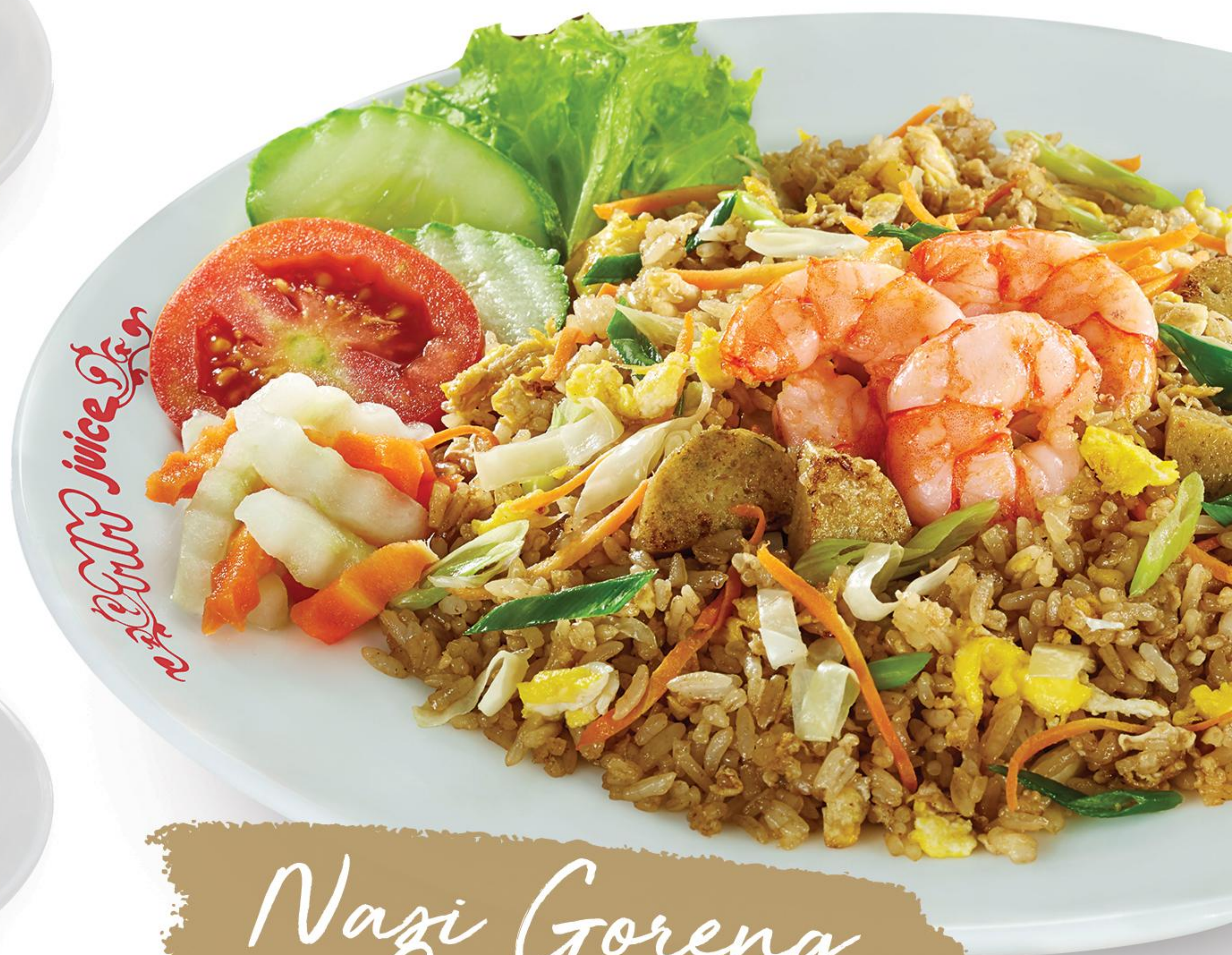
Nasi Goreng Seafood