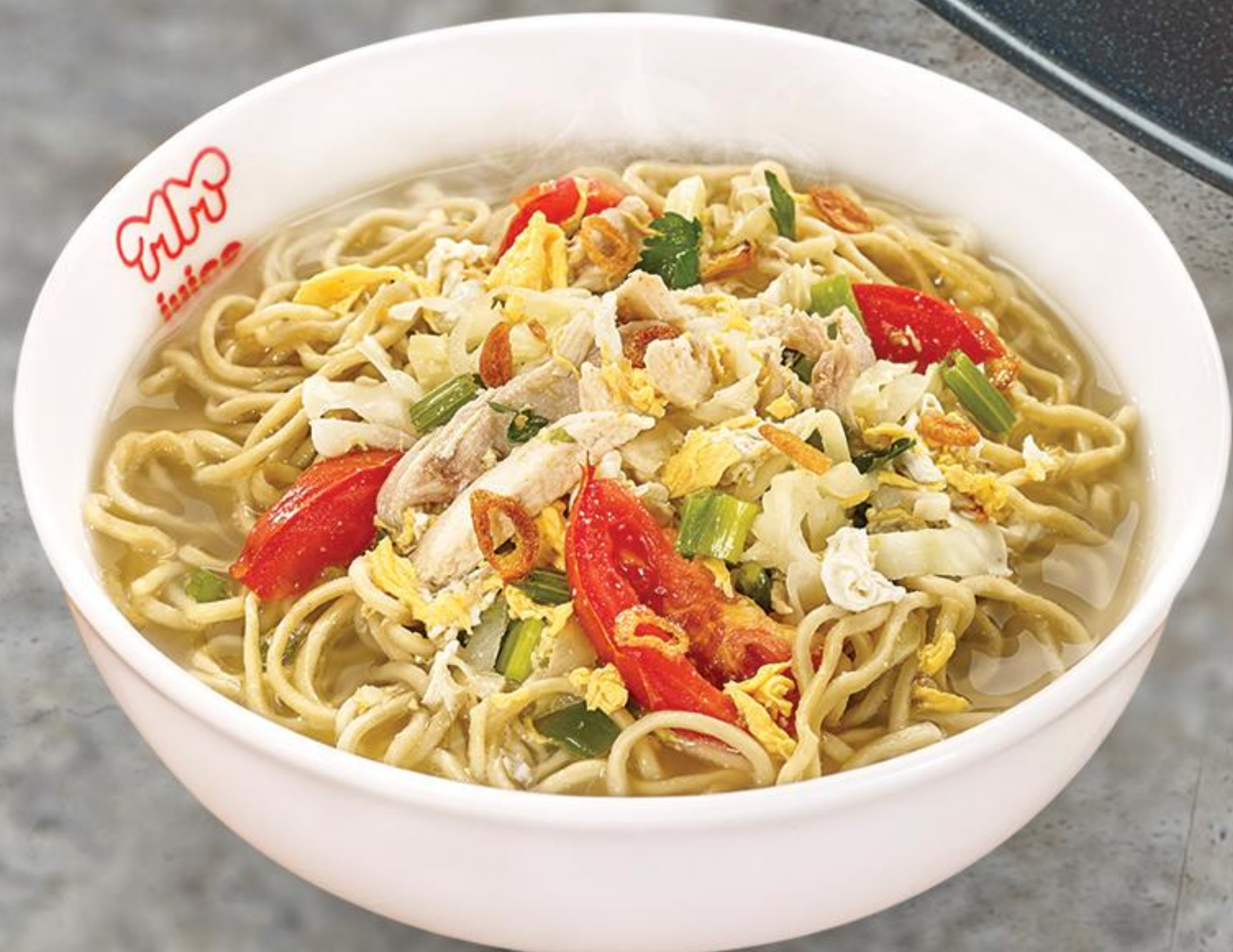
Bakmi Jawa Rebus