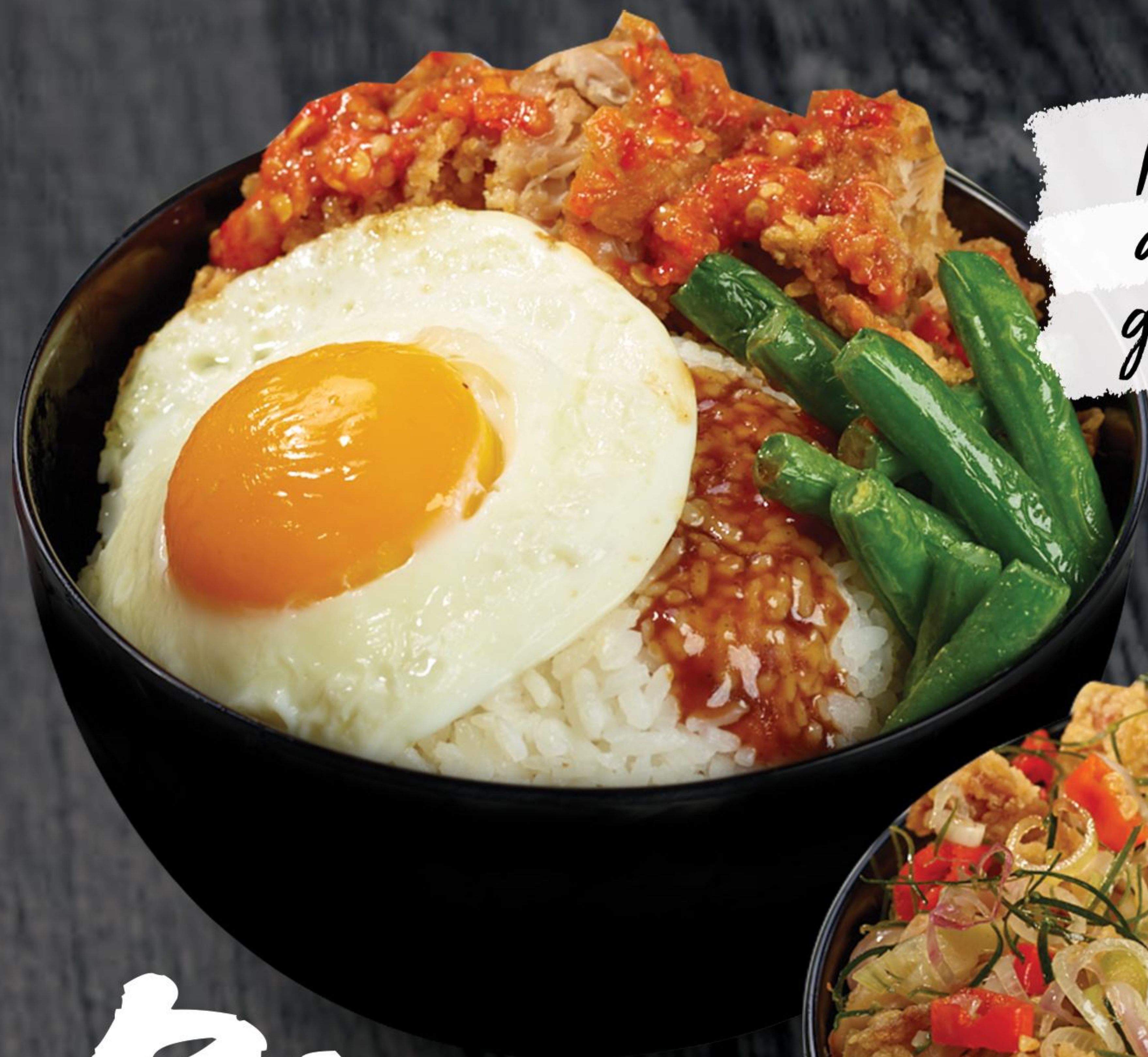
Nasi ayam geprek