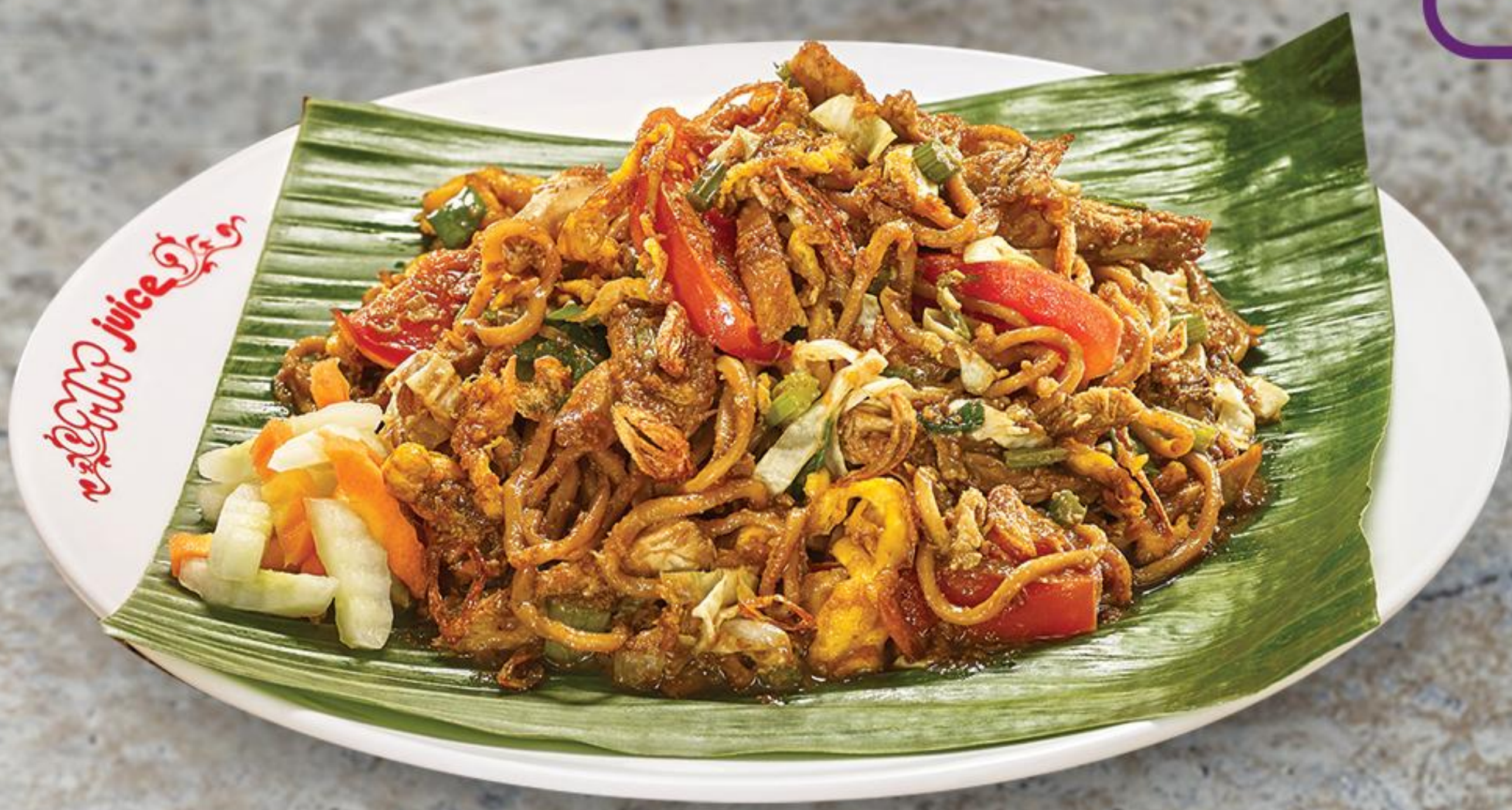
Bakmi Jawa Goreng

Mie Jawa Rebus 42.366 爪哇鸡肉汤面 (Javanese style noodle soup with chicken meat)