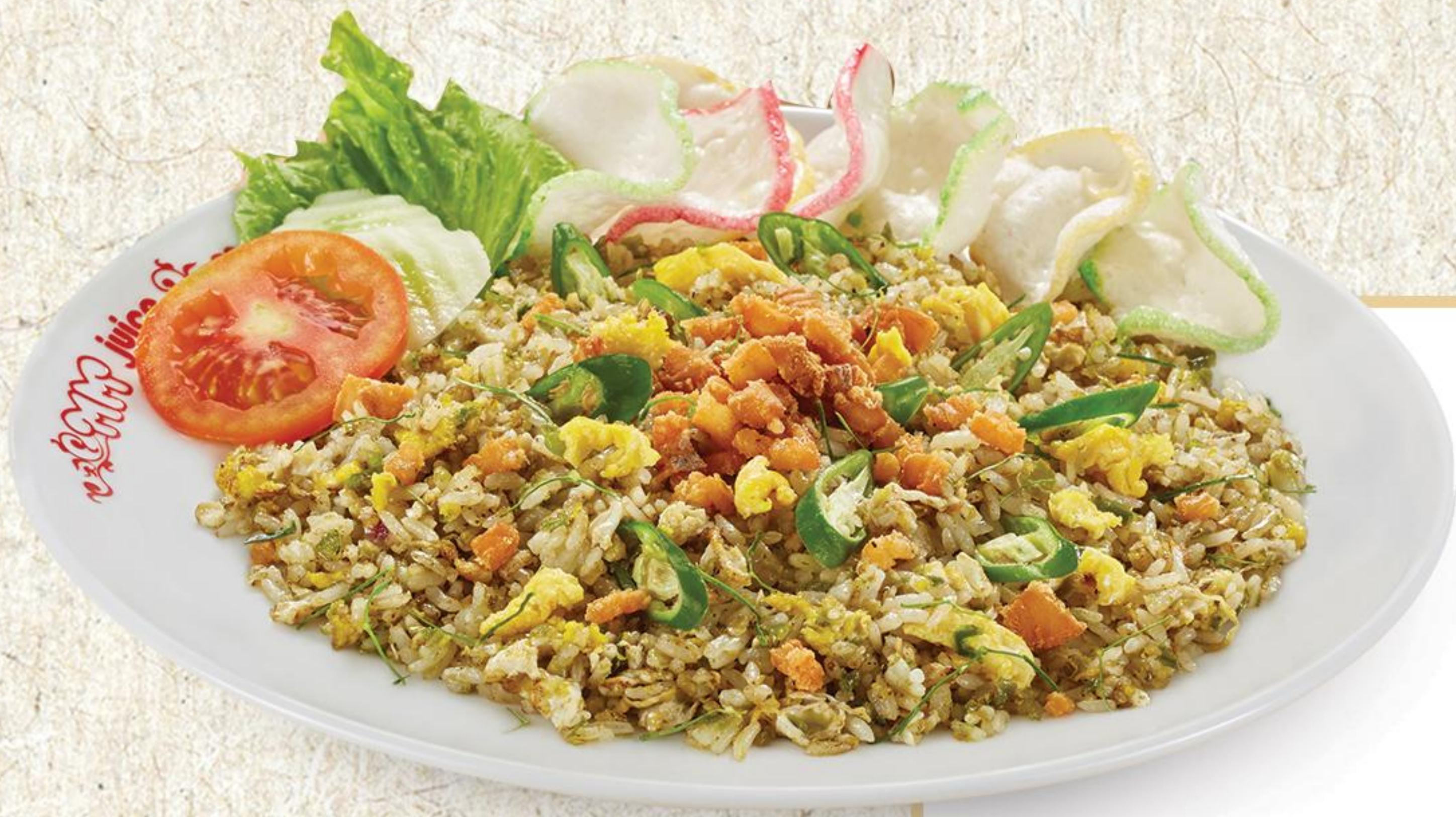
Nasi Goreng Cabe Hijau